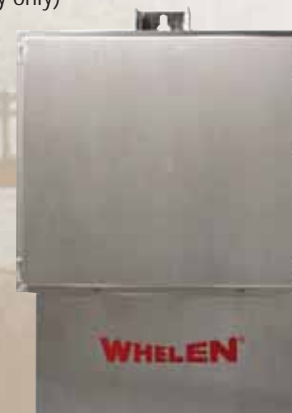
Type II Electronic Cabinet